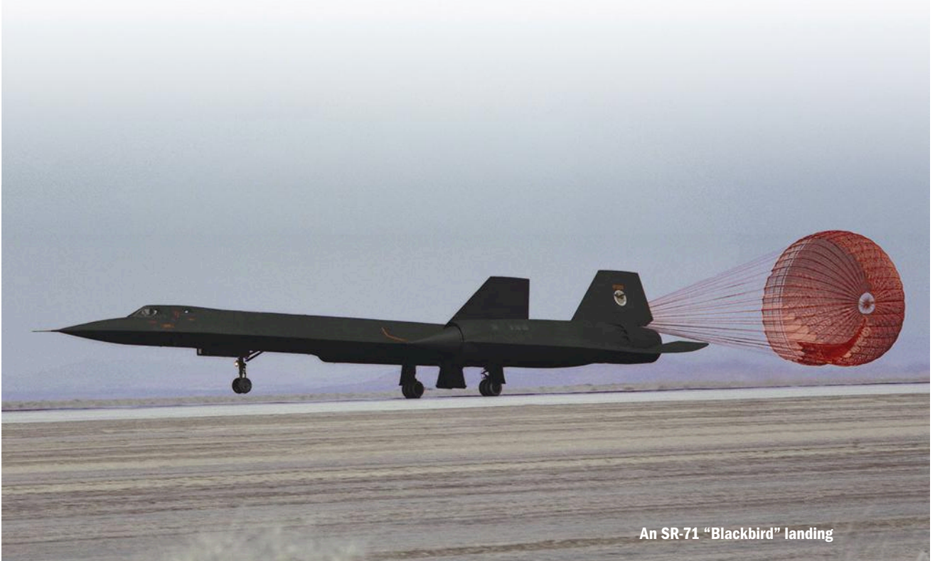
An SR-71 “Blackbird” landing

Lessons Learned: Simply put, if you’re going to shoot a visual approach, you need to add geography to