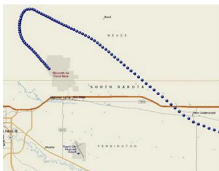
Delta Flight 2845 Flight Path

How could this happen? In the case of Delta Flight 2845, the crew appears to have been conscientious professionals in most regards. Their trouble began when they arrived from the east