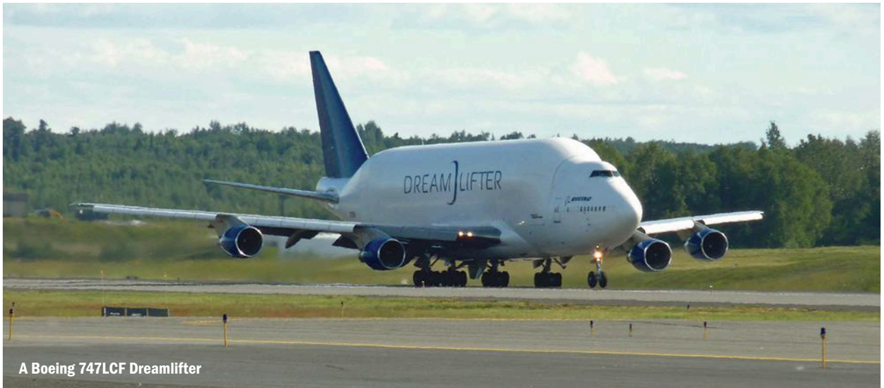
A Boeing 747LCF Dreamlifter